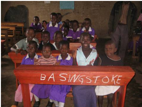
"We've got desks!"